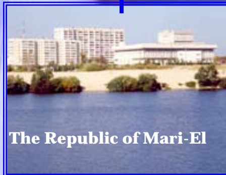
The Republic of Mari-El