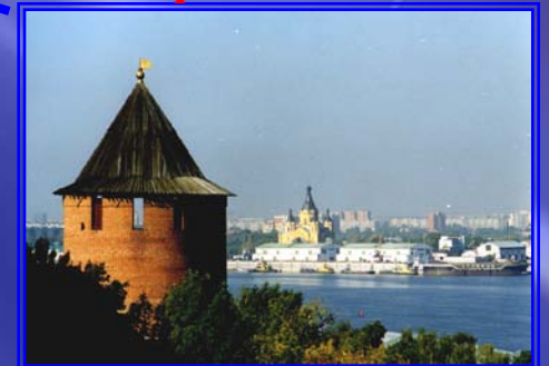
The Nizhny Novgorod region