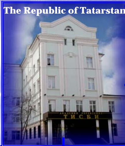
The Republic of Tatarstan