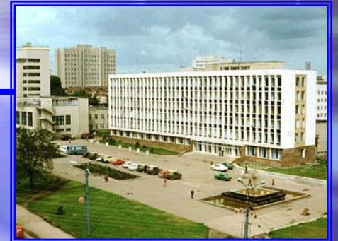
The Republic of Mordovia