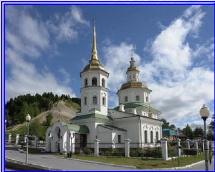
Khanty-Mansijsky autonomous region